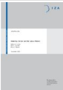
Disability, gender and the labour market (c:amaz:13960)

Discrimination against women with disabilities (c:amaz:10663)